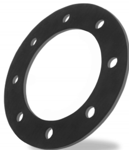
Colour - Black